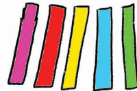
Colourful tissue paper you can cut into strips