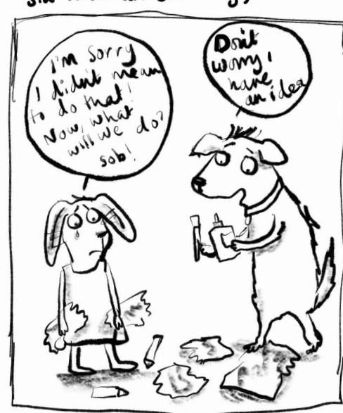
Digger felt bad and so did sid. But then he had a great idea.