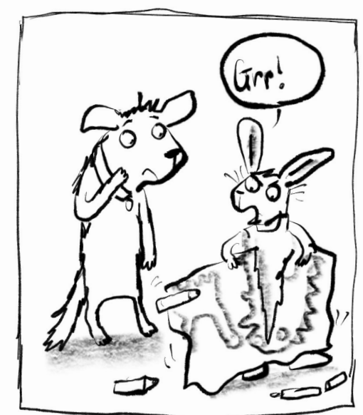
Digger got angry. She ripped up their picture.