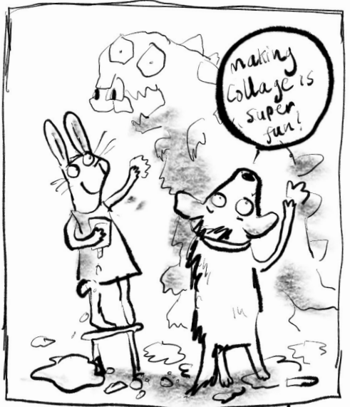
sid and digger made a giant dinosatur together out off all the surers of paper! They got give everywhere but they were friends again.