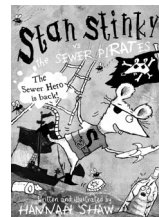
STAN STINKY vs the SEWER PIRATES By Hannah Shaw